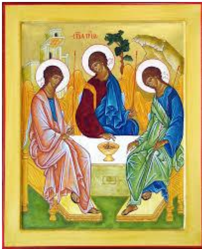
(Rublev's Trinity Icon)

The Holy Spirit is the Third Person of the Trinity