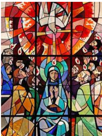
St Aloysius' church in Somers Town, London

Exercise: List your gifts and how you can use them. Offer them back to God.