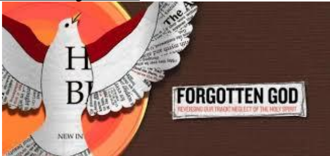
(Cover of Francis Chan's book, Forgotten God )

1 Thess 5:19 - "Do not quench the fire of the Holy Spirit."